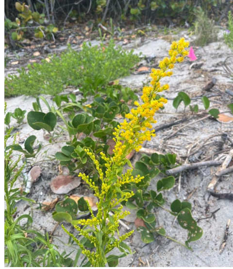
Solidago sempervirens (Seaside goldenrod)

Consider supporting our efforts which allow us to provide important conservation services such as improving our free online resources, increasing protection of rare plants and animals, restoring native ecosystems, and advocating for better public policy. Click the button below.